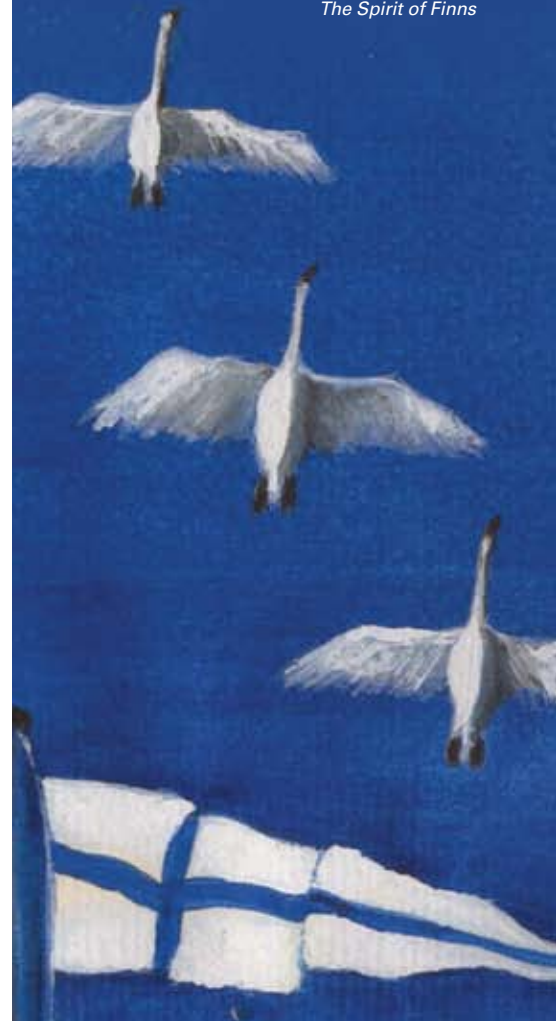
The Spirit of Finns